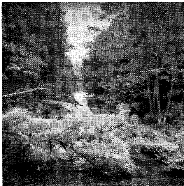
View Downstream From Bridge Key No. 7-b

justifies consideration of the restoration of the original home and the installation of fine dining facilities for public use.